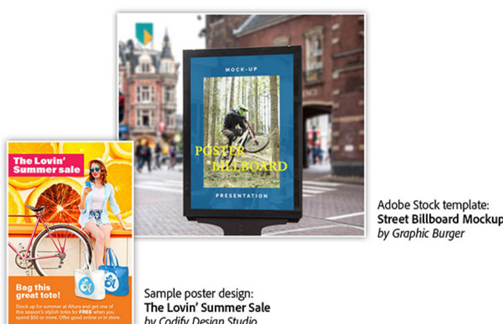
Right image: Sample poster — by Codify Design Studio, left image: Street Billboard Mockup — by Graphic Burger.

If you'd like to follow along with this tutorial, download the following sample poster and free Adobe Stock template. You can also watch this tutorial as part of the Enhance Your Portfolio with Unique Projects and Adobe Stock webinar.