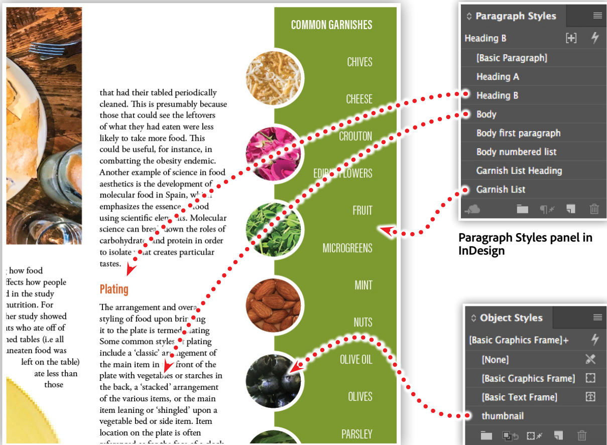
Page layout in InDesign

InDesign is one of the most stylish applications in the Creative Cloud. That's because there are so many things in InDesign that can be attached to styles. In addition to text, styles can be created and applied to any object, text, and graphic frame, and even added to advanced object properties, such as Anchored Objects.