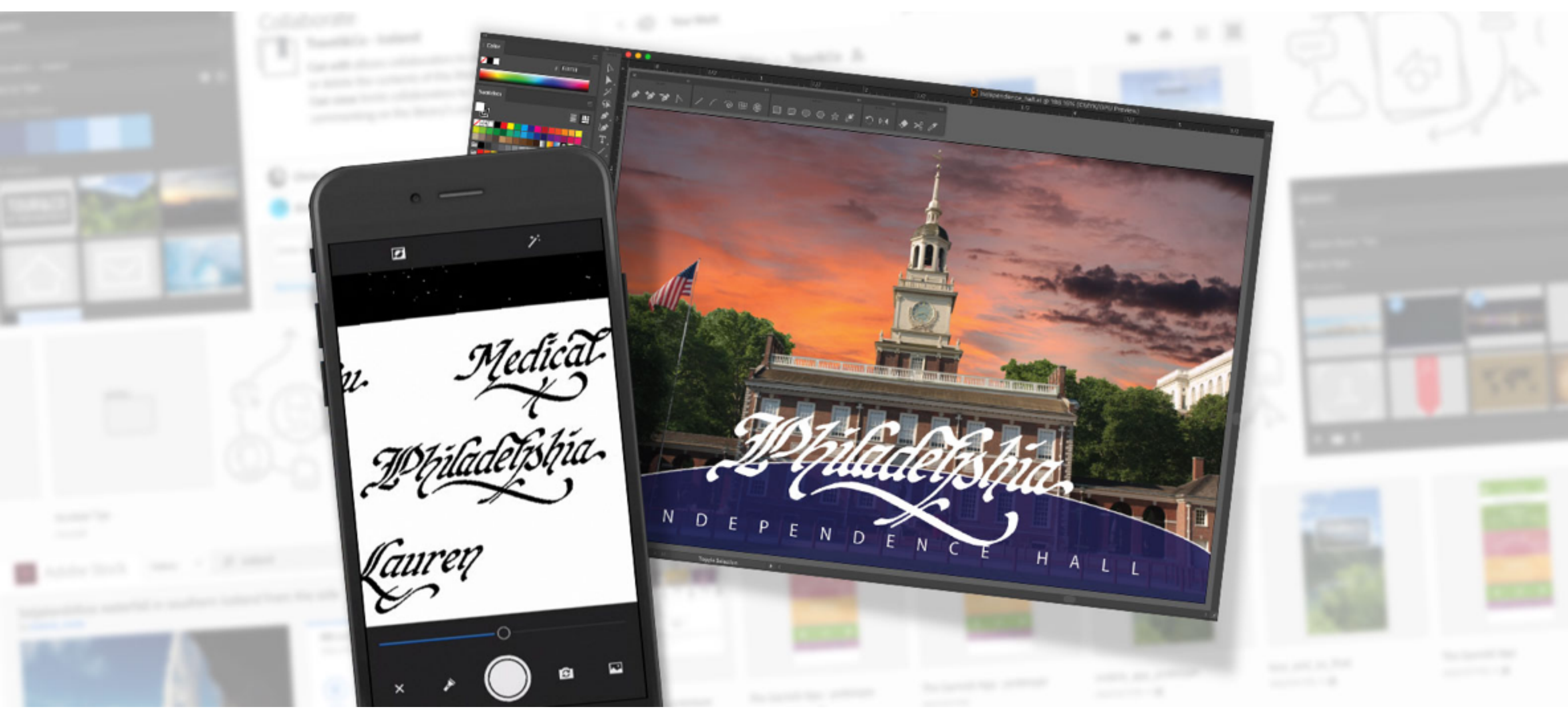
Design by Codify Design Studio.